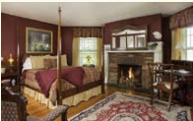
Robert Frost Room

1889 WhiteGate Inn and Cottage provides luxurious bed and breakfast accommodations, just minutes from the city's historic downtown. The distinctive guest rooms and Carriage House honor distinguished poets. Each guest room is uniquely decorated. Poetry volumes by each featured poet are included in each room.