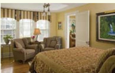
Carl Sandburg Suite