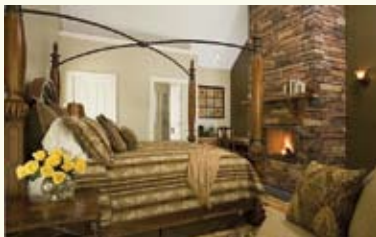
Elizabeth Barrett Browning Suite