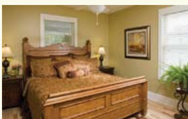
Joyce Kilmer Suite