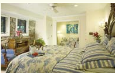
The Walt Whitman Garden Spa Suite