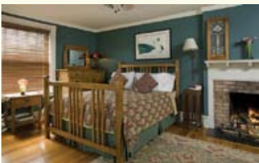
Dorothy Parker Room