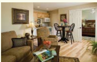
Oscar Wilde Suite