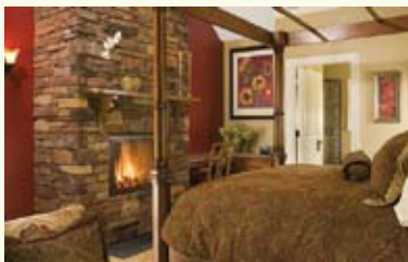
Ralph Waldo Emerson Suite