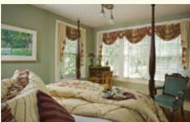
Emily Dickinson Suite