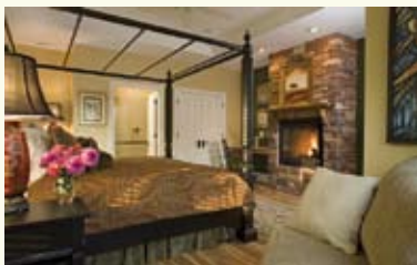
Maya Angelou Suite